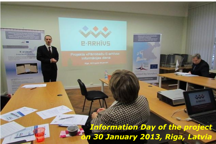
Information Day of the project on 30 January 2013, Riga, Latvia