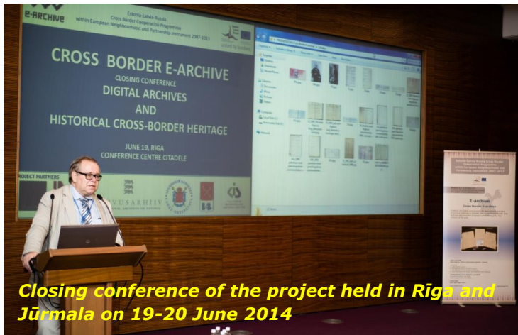
Closing conference of the project held in Riga and Jūrmala on 19-20 June 2014