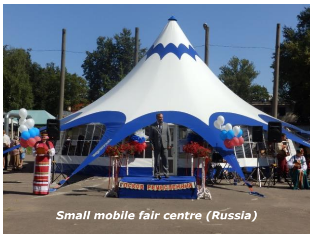
Small mobile fair centre (Russia)