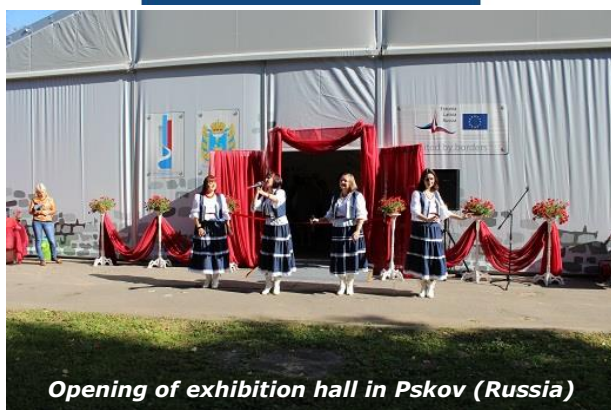
Opening of exhibition hall in Pskov (Russia)