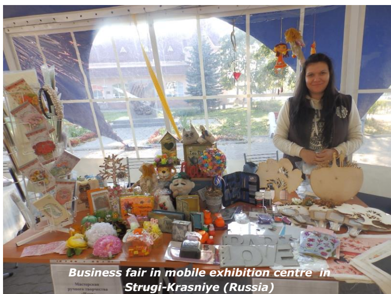
Business fair in mobile exhibition centre in Strugi-Krasniye (Russia)

Cooperation Agreement and Working plan for SME development (Memorandum) signed by Partner organisations to develop established network