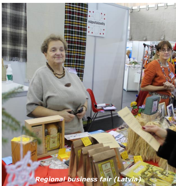
Regional business fair (Latvia)