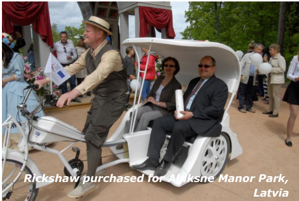
Rickshaw purchased for Aluksne Manor Park, Latvia