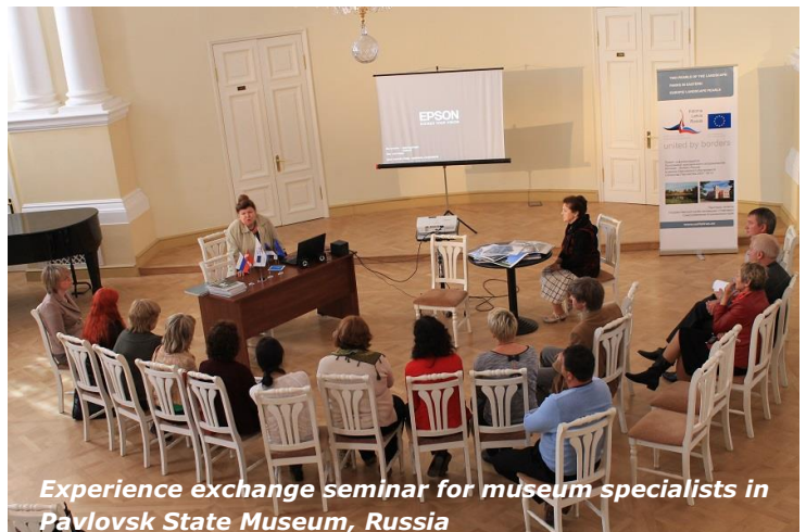
Experience exchange seminar for museum specialists in Pavlovsk State Museum, Russia

Raised awareness and increased capacity and competence among Latvian and Russian experts and museum specialists in the field of restoration, local crafts, preservation of objects of cultural and historical heritage