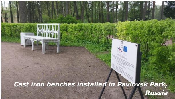
Cast iron benches installed in Pavlovsk Park, Russia