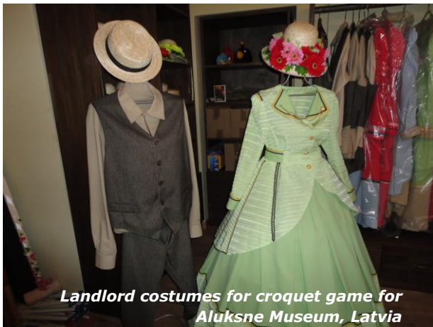
Landlord costumes for croquet game for Aluksne Museum, Latvia