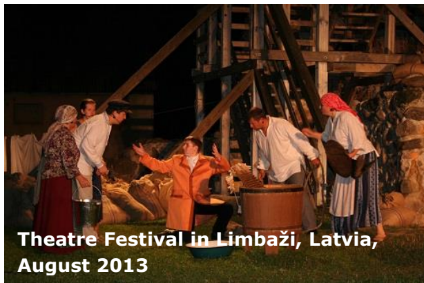
Theatre Festival in Limbaži, Latvia, August 2013