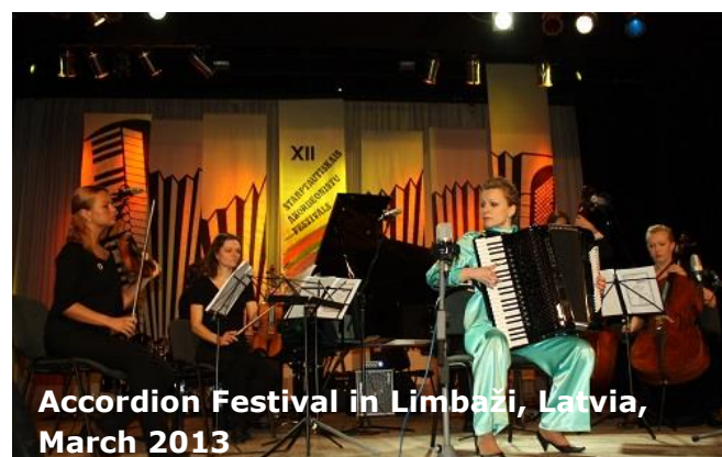
Accordion Festival in Limbaži, Latvia, March 2013