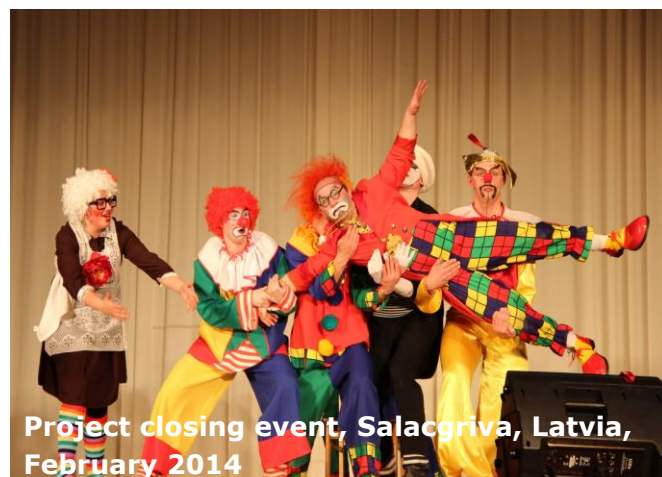
Project closing event, Salacgriva, Latvia, February 2014

The Cooperation Agreement concluded between Limbaži Municipality (Latvia) and Administration of the municipality formation of the town Volhov of the Volhov municipal area (Russia)