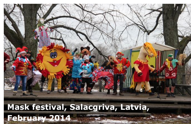
Mask festival, Salacgriva, Latvia, February 2014