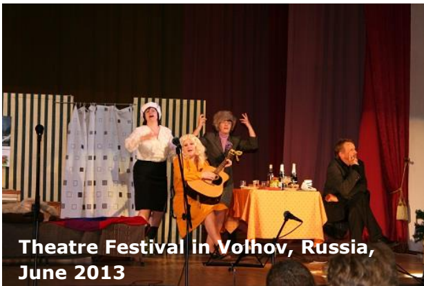
Theatre Festival in Volhov, Russia, June 2013