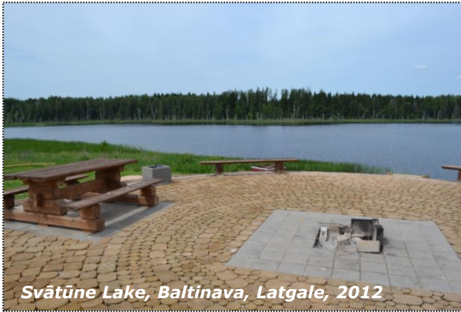
Svātūne Lake, Baltinava, Latgale, 2012