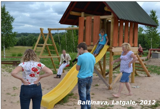
Baltinava, Latgale, 2012