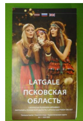
Newsletter and Map