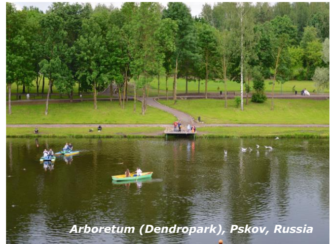
Arboretum (Dendropark), Pskov, Russia