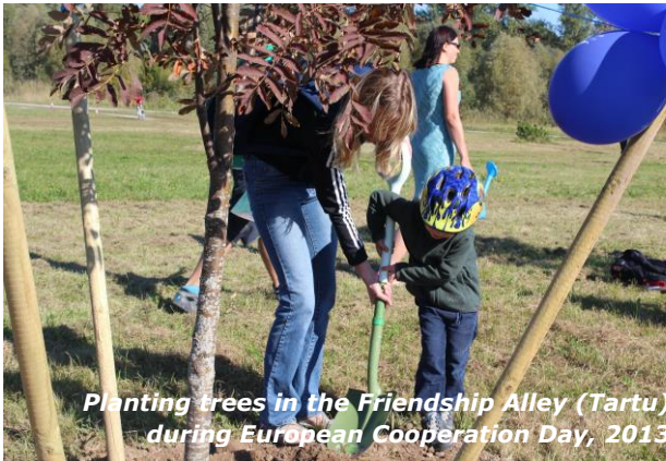
Planting trees in the Friendship Alley (Tartu) during European Cooperation Day, 2013