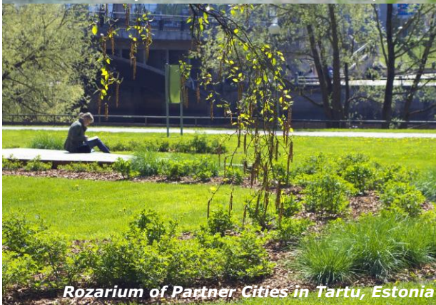
Rozarium of Partner Cities in Tartu, Estonia