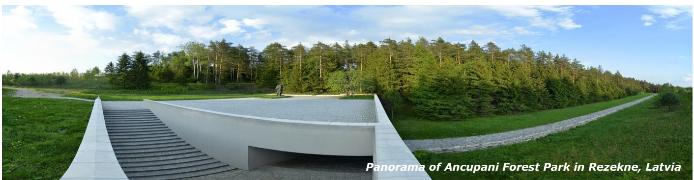
Panorama of Ancupani Forest Park in Rezekne, Latvia

Strengthened co-operation of NGOs with local and regional authorities from Tartu, Rezekne and Pskov in the field of urban development and spatial planning, green management