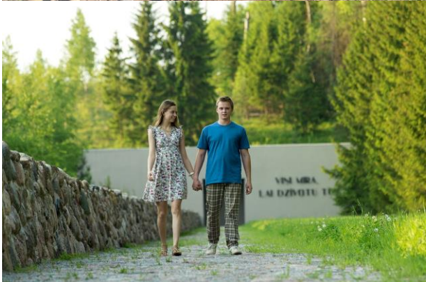
Ancupani Forest Park in Rezekne, Latvia