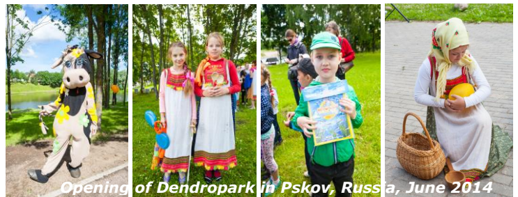
Opening of Dendropark in Pskov, Russia, June 2014