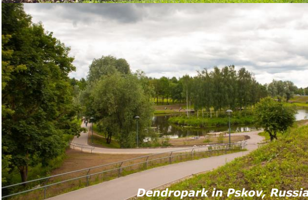
Dendropark in Pskov, Russia