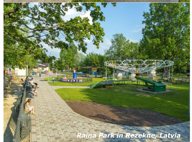
Raina Park in Rezekne, Latvia