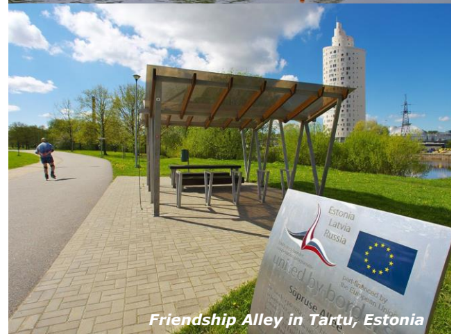
Friendship Alley in Tartu, Estonia