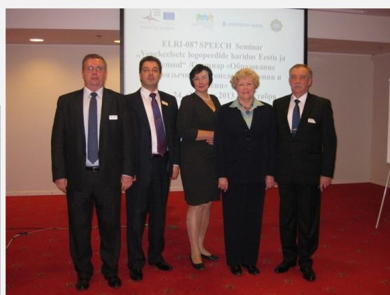
24 October 2013, Tallinn, Estonia. Research and practice seminar "Education of Russian-speaking speech therapists in Estonia and Russia"