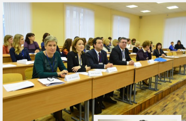
12 February 2014, St. Petersburg, Russia. Seminar "Modern education standards and speech therapy: European and Russian approach"

Speech therapy curriculum in partner institutions is analyzed and activity plan is worked out