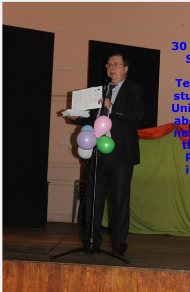
30 November 2012, St. Petersburg, Russia. Teaching staff and students of Herzen University informed about beginning of new project during the Faculty Day: Project leaflets introduced and disseminated