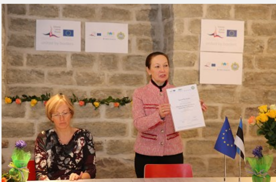
Ceremony of awarding certificates to the participants of the trainings for speech therapists

Speech specialists and students of both countries are informed about speech therapy best practices, new trends and project achievements through publications in specialized magazines, Brochure, Leaflets.