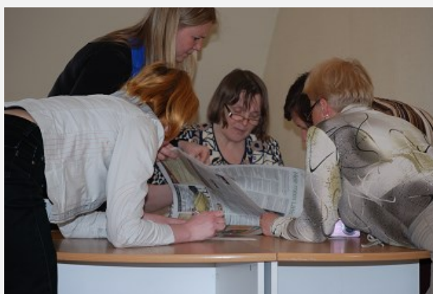
Speech therapists—participants of practical trainings in St. Petersburg, Russia at work